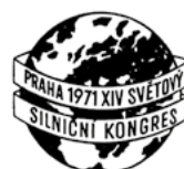
LOGO OF THE XIV TH WORLD ROAD CONGRESS

Strategic Plans covering the period between World Road Congresses, including proposals for individual strategic themes. To address these, it establishes Technical Committees and Task Forces. The results, including the implementation of Strategic Plans, are presented at the end of each four-year period at the World Road Congress.