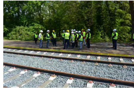
Tram tracks and walk next to the Park

parks and the tram tracks, thus creating a «walk».