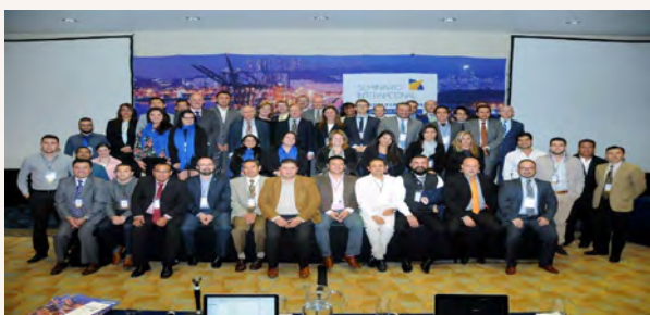
Speakers and assistants of the International Seminar on Logistics and Roads

Regarding the efficient use of energy, Germany, France and Sweden presented the innovations of electric roads. A method capable of supplying electrical energy to vehicles through elevated or floor level systems. The Mexican Institute of Transportation presented the « Technical Driving » training to reduce the energy consumption in the operations of the heavy transport.