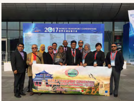
The 12-member REAM delegation to the WTC.

As an official supporter of the inaugural World Transport Convention (WTC), REAM organised a delegation to this event held from 4 to 7 June in Beijing, China. REAM also organised a pre-convention technical study tour to the Jiangsu Transport Institute (JSTI) in Nanjing on 2 June and a post-convention tour to the Research Institute of Highway (RIOH), Ministry of Transport in Beijing on 8 June.