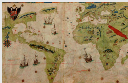
Amerigo Vespucci, Mappa mundi, 1526

as you know the National Committees constitute the propagation of the Association in each single Country. They carry out not only a role as representatives but also an operational role developing locally their activities within the Association. Recently, Poland has formed a Committee and in the next meeting of the Council in Bonn we will have 41 National Committees