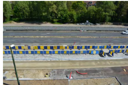
Overview of a running phase, from the third floor of the building of the RRC in Woluwe