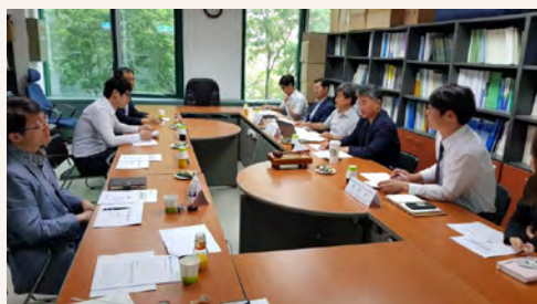
Korean NC Council Member Meeting

both public and private sector at 25 th International Winter Road Congress. Korean NC will organize a Korea Pavilion to promote Korea's latest technology.