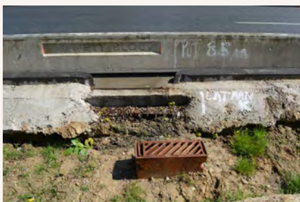
Excavation work for a valley. The slot under the border let water from the roadway, while the drain will overflow

alignment (ash trees and elm trees) and set up the «valleys» with a gravel floor. Thus, the water flowing from the floor can seep into the ground, while the excess water will be evacuated by the gullies. For this evacuation, two new secondary collectors will be posed (in addition to the existing main collector).