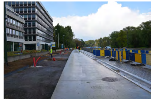
Redevelopment on the side of buildings. From left to right: (future) Green band, with benches here and there; sidewalk (forthcoming); two-way cycle track (concrete); Strip of parking (cobblestone).

On the other side, a two-way cycle track and a wider sidewalk for schools are planned.