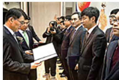
The 25th Road Day Celebration