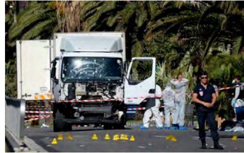
The attack in Nice

subject of security and to collect real life scenarios with the contribution of the participants.